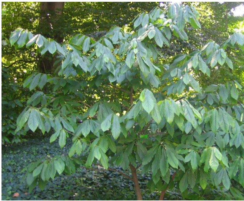
Paw Paw Asimina triloba